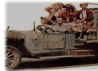
You CAN Get There from Here!